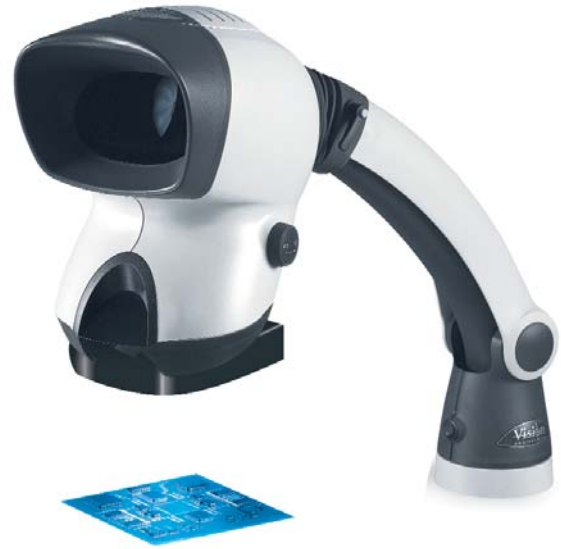
Mantis Elite UV with swing away boom mount for added flexibility

Mantis Elite UV is a variant of Vision Engineering's Mantis Elite stereo microscope, offering clear, magnified imaging of UV fluoresced cracks, flaws and coatings. Fault detection is made more effective by magnification highlighting minute cracks and pitting.