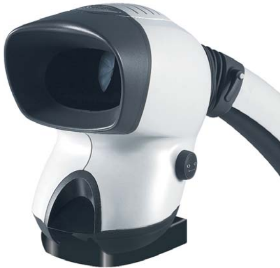
Eyepieceless optics increase operator head freedom, reducing fatigue

Mantis Elite utilises Vision Engineering's patented Expanded-Pupil technology to provide up to 10 times greater freedom of head movement than conventional binocular eyepiece microscopes.