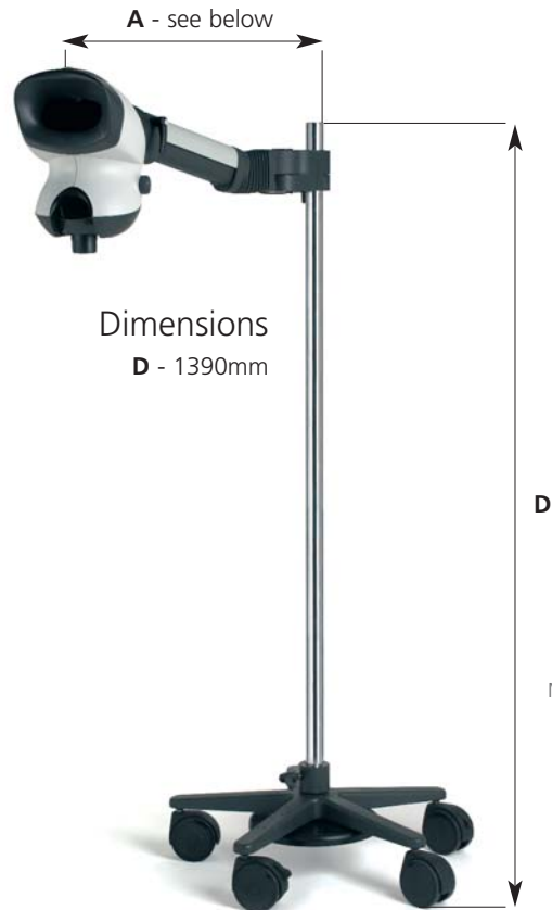
Mantis Compact, with articulated arm, secondary link and floor stand illustrated.

All Mantis units are powered with a wall plug socket transformer, available in all worldwide plug configurations and delivering 9V DC to the Mantis illuminator in the optical head.